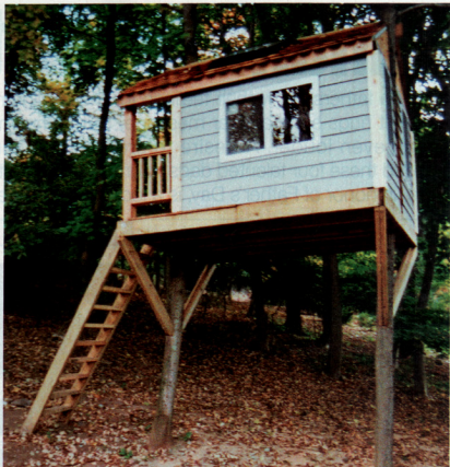
Dad's one of the gang when it comes to playing in the Gusicks' private hideaway.

My children love playing in the tree house, and it's a big draw for their friends. Seeing them enjoy something that I built with my own hands is very gratifying to me. When they're up there, I'm with them in spirit.